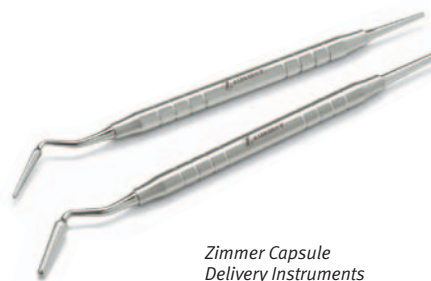
Zimmer Capsule Delivery Instruments

To learn more about the Zimmer Collagen Capsules and Wedge, please visit us online at www.zimmerdental.com or to speak to a sales representative, call 1 (800) 854-7019.